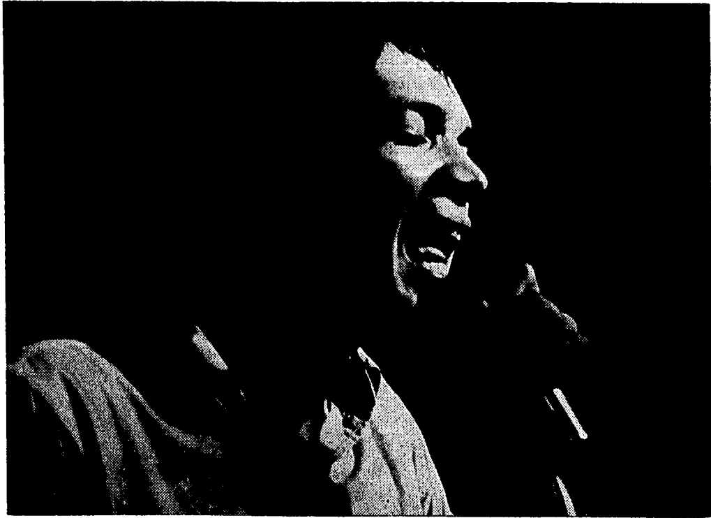
MITCH RYDER displays his vocal magnetism as he performs. Booked by Premier Talent Association of New York, Mitch will sing tonight at 8 in Jones Auditorium.