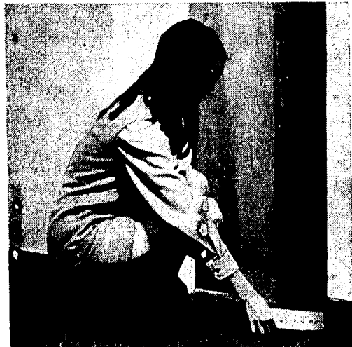
"Beat Monday" Again

it under the door or the TWIG room. And forget about it — for a couple of days at least.