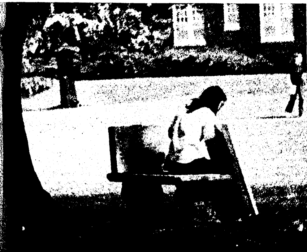
On this day—not tomorrow. Fight for a principle, Express your gratitude, overcome an old fear, take two minutes to appreciate the beauty of nature.

The committee was also in informal agreement that an October holiday would be desirable. The committee indicated that it would be willing to extend the exam period by two days in order to obtain an October holiday if the Academic-Administrative Council proposed such a change. The committee also suggested if a reduction in the length of the exam period was recommended by the ad hoc committee reviewing the exam schedule, then an October holiday should be added rather than beginning Christmas holidays earlier.