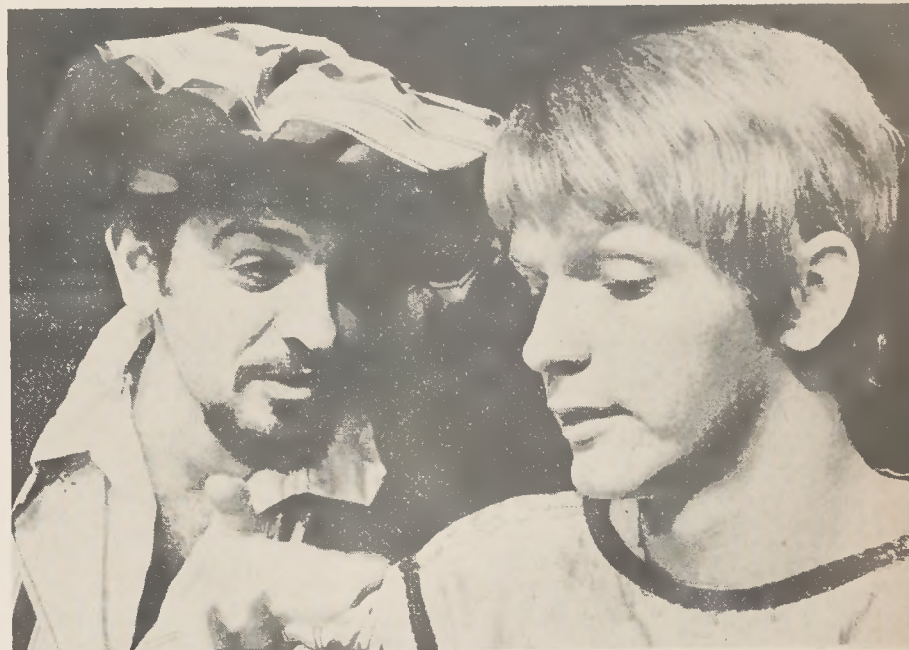
Antonio and his friend Bassanio discuss the terms of the "pound-of-flesh" contract in Shakespeare's "The Merchant of Venice."

On Friday night, the trustees entertained faculty and special guests at a dinner in Belk Hall.