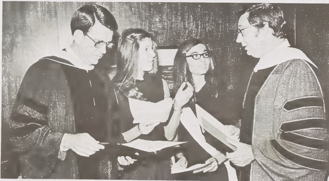
Are you sure you've got this right?