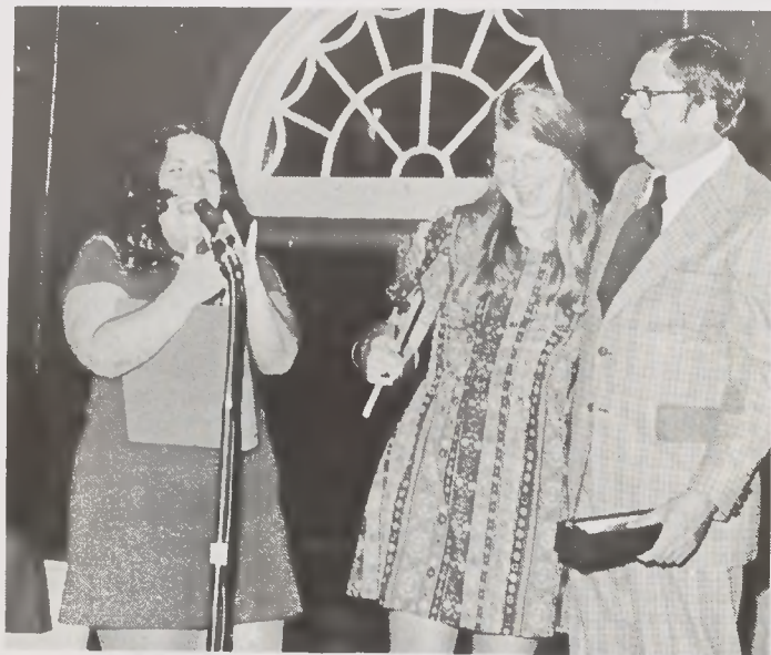
This is my life? You've got to be kidding!