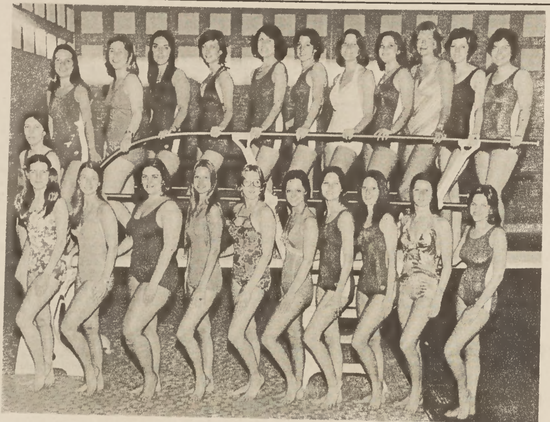
Aqua Angels present ANIMAL CRACKERS IN MY SOUP. April 17, 18, 19, 21 at 8:00 p.m. Donations will be taken for N.C. Zoo at Asheboro.