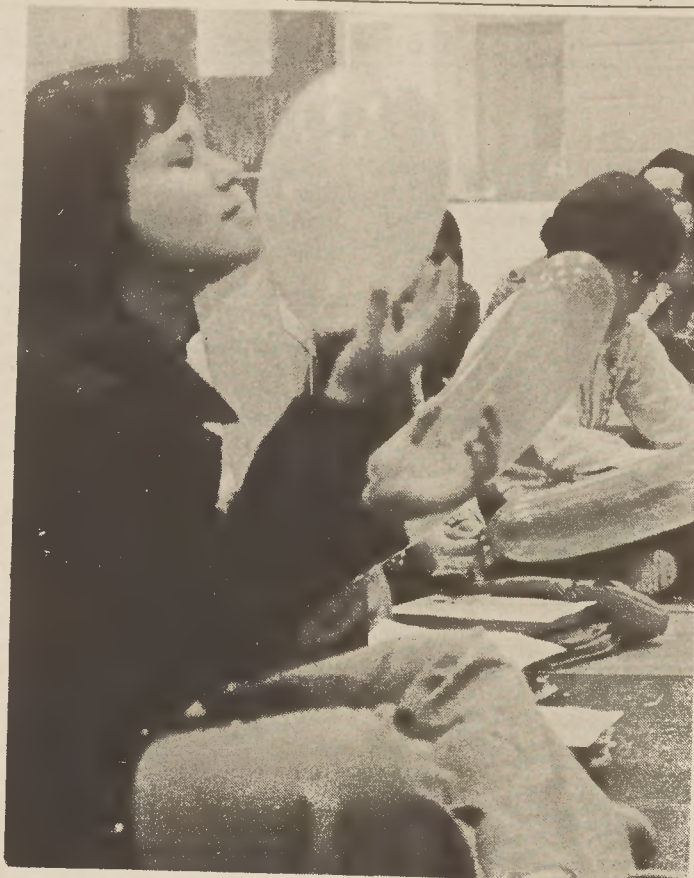
Students play with balloons preceding Monday's program, "Childhood - the simple faith."

The members of the Black Voices in Unity invite everyone to participate in this Bicentennial salute of Black Awareness Week.