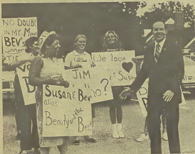
Students greet Bev Lake with rally as he arrives for gubernatorial debate.

I. Beverly Lake was greeted by members of the College Republicans representing Meredith College, N.C. State, and Peace College. Supporters displayed banners and chanted, "We Want Bev" and "Lake in '80". Governor Hunt arrived earlier without detection, apparently for security reasons.