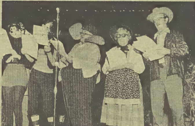
The faculty present their song at Cornhuskin'.

departments competed against each other in various activities, including a sack race. At this time, a Duke and Duchess are named, whom