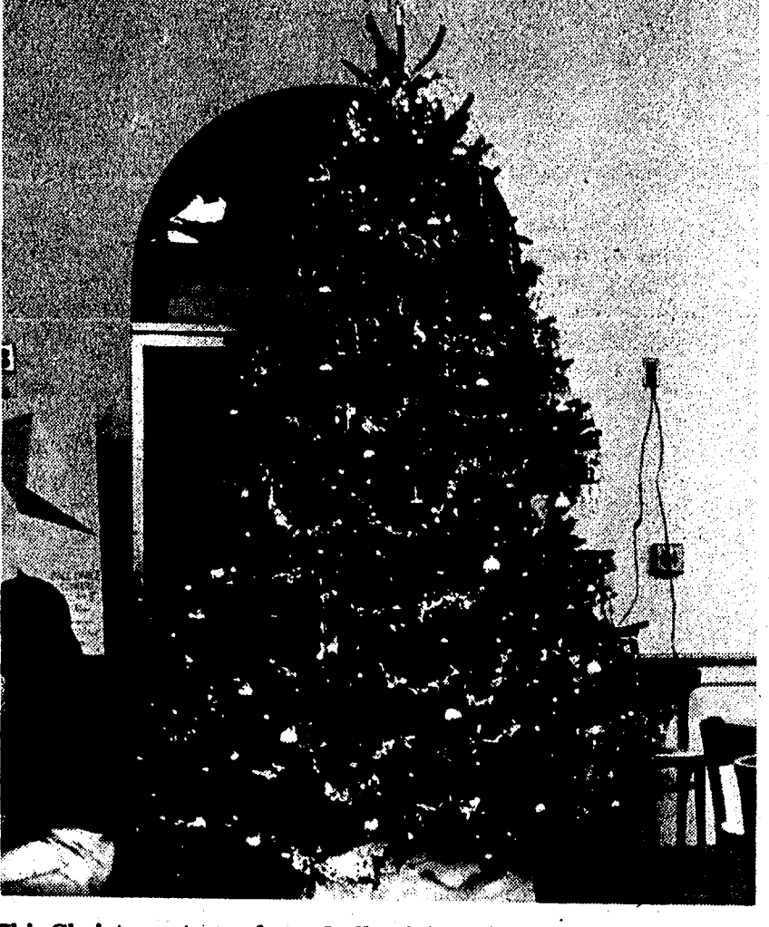
This Christmas tree adorns Belk Dining Hall adding a little of the Christmas spirit.

The Judicial Board then met at 8:00 to hear another case. This case involved a student accused of theft. She was found guilty by a jury and suspended by the Board. She is appealing her case.