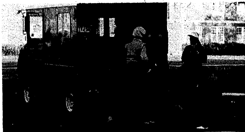
Roller skating was one of the many activities offered at Play Day.

This year's affair, held Tuesday, April 6th in the