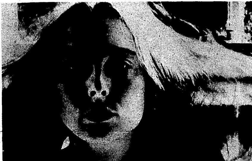
Ann Beattie was the visiting Woodrow Wilson Fellow the week of April 19.