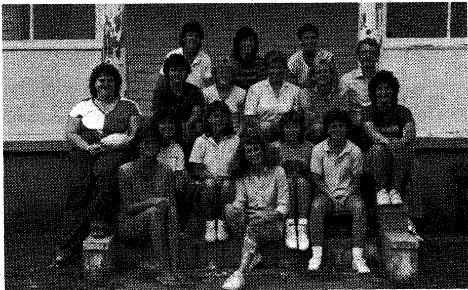
The MCA Council