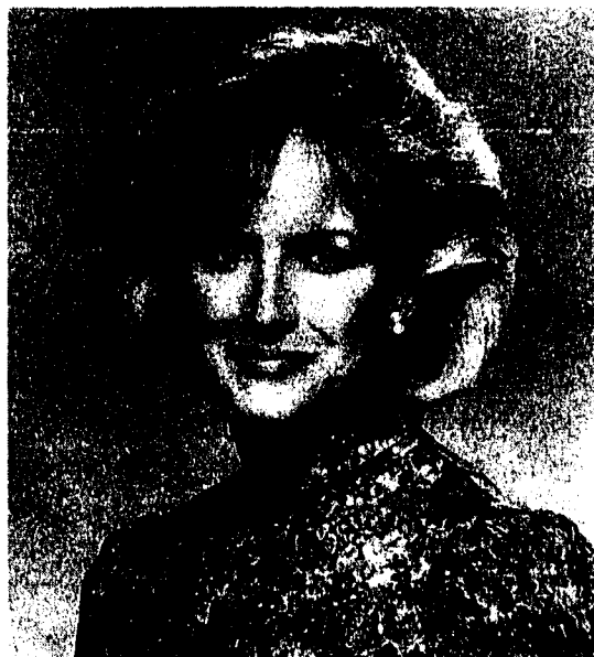
Ms. Judy Woodruff CARLYLE CAMPBELL LIBRARY MEREDITH COLLEGE