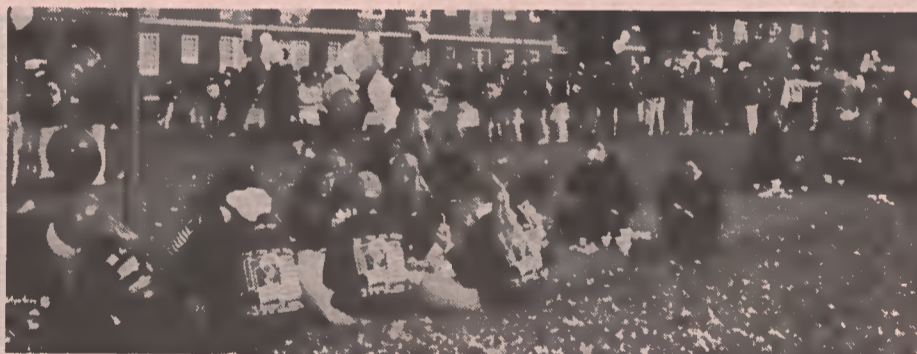
Students enjoy the picnic in the courtyard before Cornhuskin'.