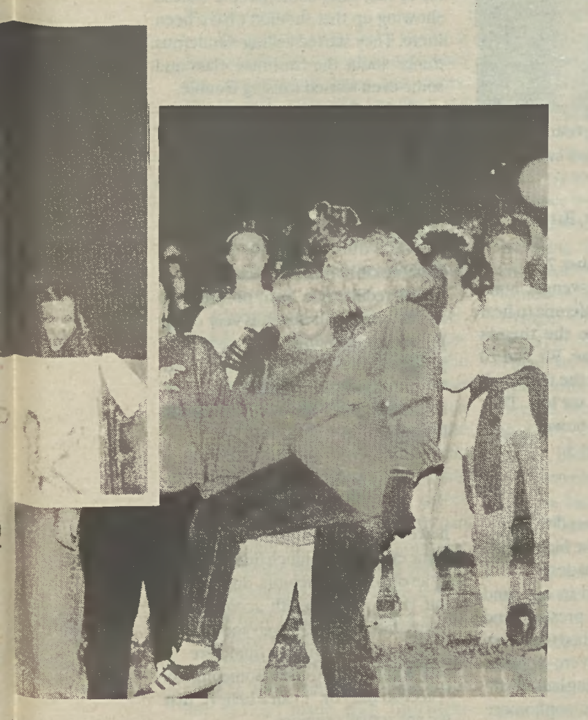
The freshmen finally "experienced it," and this Cornhuskin' was a winner for the entire class.