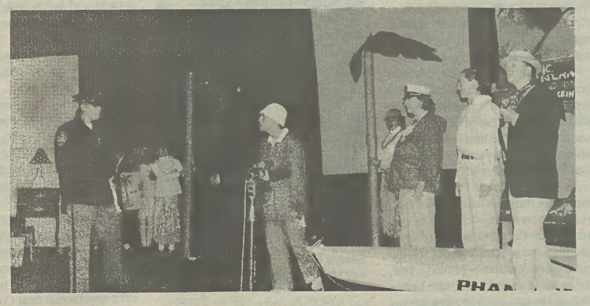
Meredith security caught this group of sailors staying a little longer than their allotted three-hour tour of the campus (and its angels). The sophomores really told us a whale of a tale!