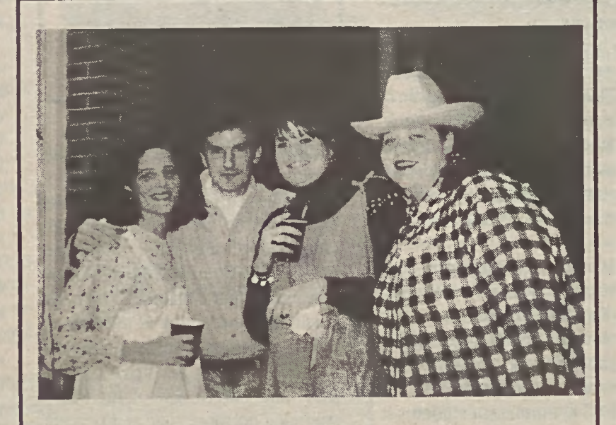
Meredith students have fun with friends at the Haunted Ho-Down.

spoken in Nahuatl with subtitles in Spanish and English