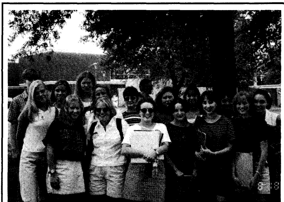
Two student advisers and their freshmen advisees take a tour of the campus before the President's Brunch.