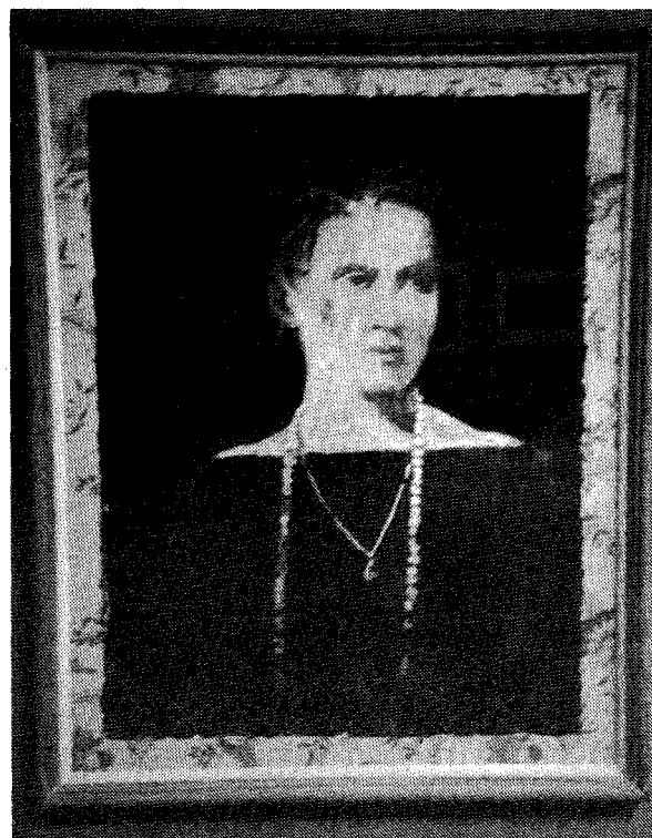
Noyes Capeheart Long's exhibit will run through March 22, 1998. This painting, "Woman with Pearls," is one of the many pieces on show.

The Noyes Capeheart Long exhibit will remain open for viewing until March 22, 1998.