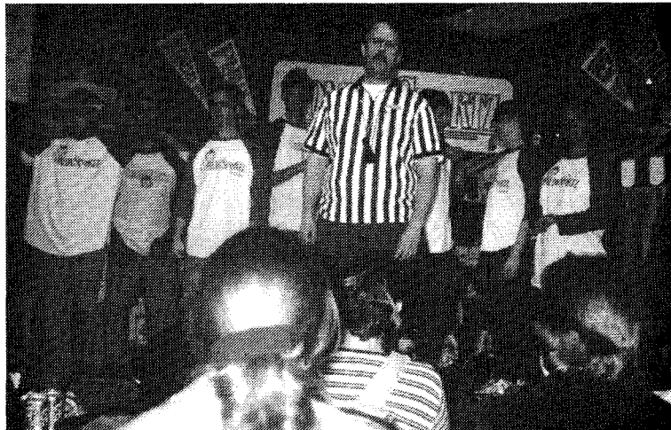
Comedy Sportz' Blue and Red teams fought it out with their comedy improvisation antics.

Those who went enjoyed the two teams of improv comedians who competed against each other