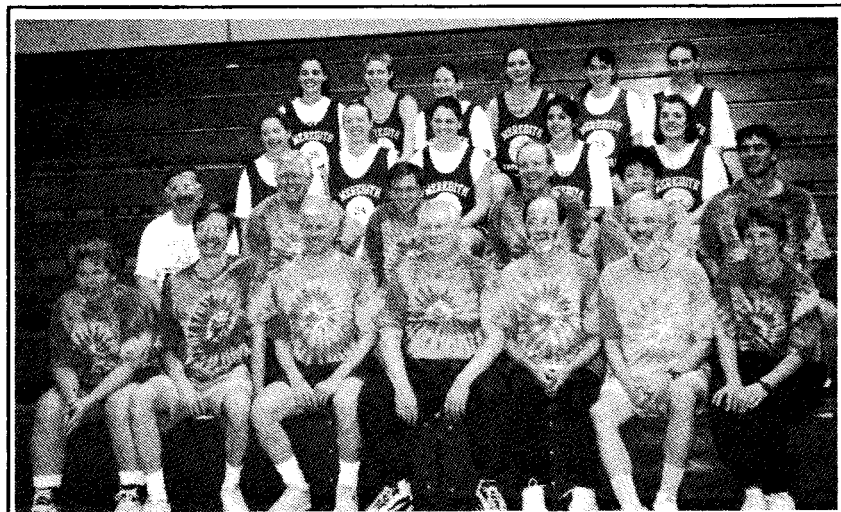
The Relics and the Angels in a friendly moment.