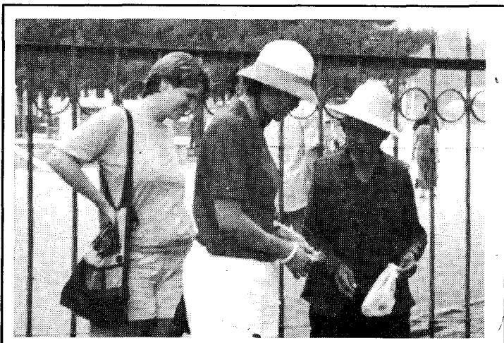
Some Meredith students from the last group that went to China stop to talk to a Chinese man.