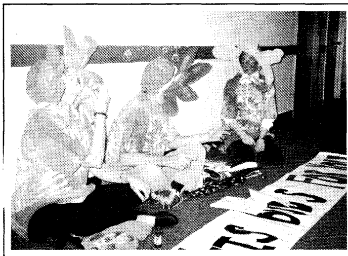
The flowers practice their routine before a performance. Their jokes brought many laughs.