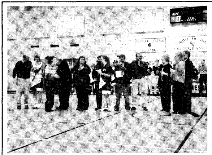
The seniors on the basketball team are recognized for their contributions to Meredith's team.

This weekend, the Angels will play a tournament at home to end the season.