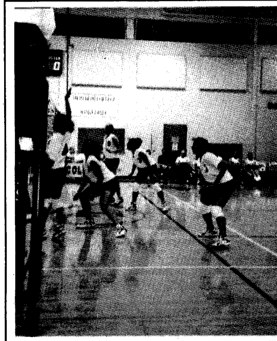
The Meredith volleyball team prepares to defend itself against NC Wesleyan.

The volleyball team stands at 8-3 going into this week's home games. Thursday's game starts at 7 p.m. in Weather-