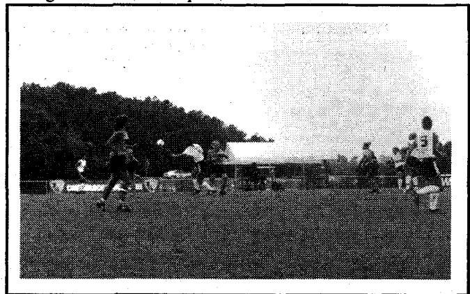
Meredith and Converse hit the field for the first time this season. Meredith beat Converse 4-2 yesterday.