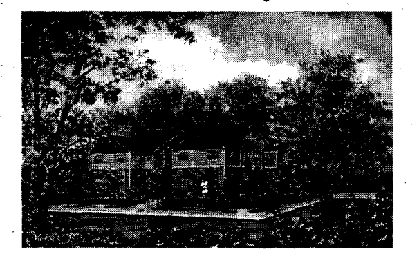
University Woods 3020-104 Centennial Woods Dr. Model Open Daily 11-6

Come stay with us! 8 Exciting New Locations University Woods at Centennial