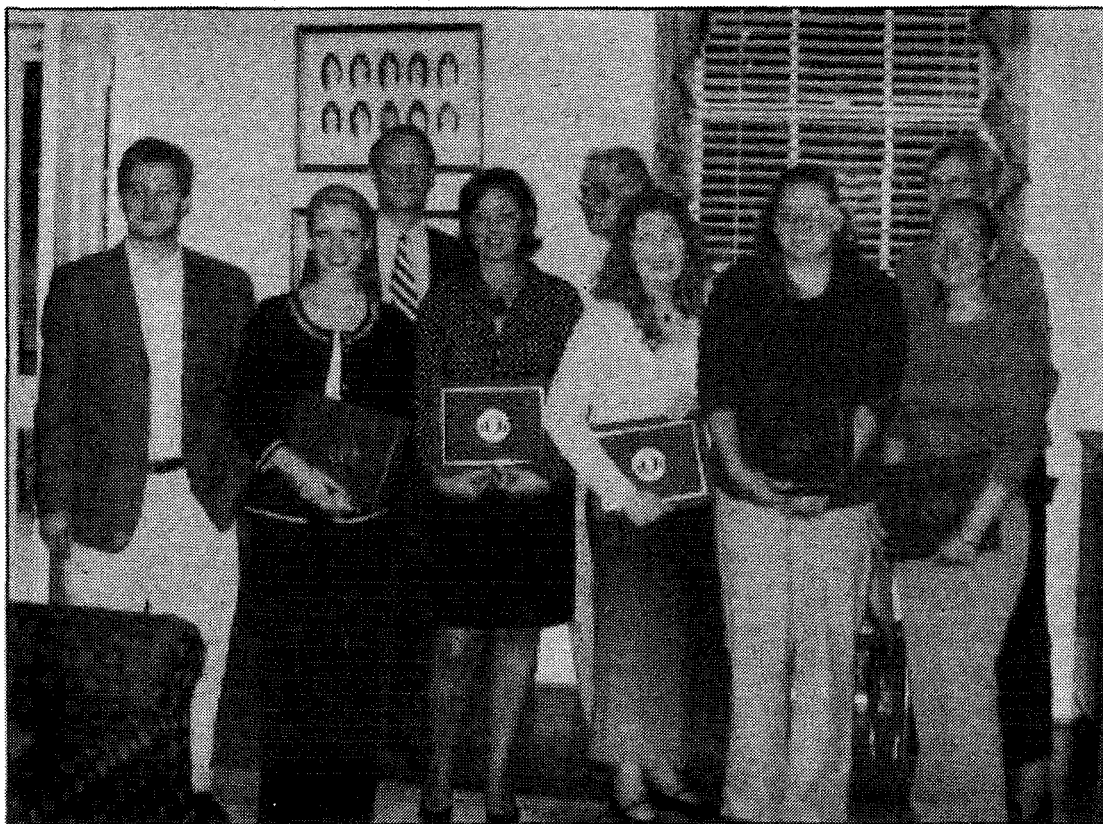
This year's inductees for Pi Sigma Alpha.

An induction was held on September 12 at the alumnae house, where Mayor Charles Meeker was the guest speaker. Mayor Meeker spoke of the importance of civil engagement and being involved within local government.