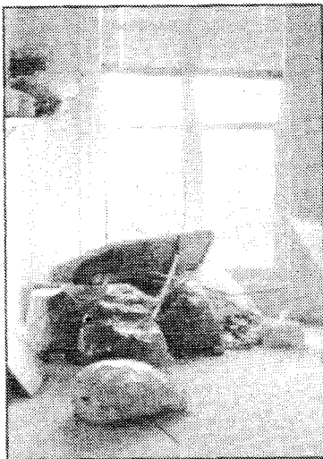
First floor hallway.

There was a meeting held Tuesday night to clarify the details of the situation. Look for coverage of this meeting and the possible move to Faircloth in next week's Herald .