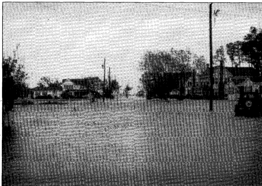
Floodwaters cover roads in Carteret County.

"The parks and recreation tennis courts in Smyrna has been turned