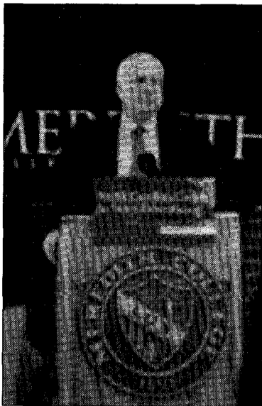
Senator McCain at the luncheon.