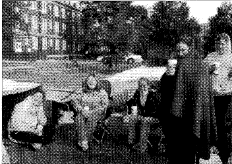
Students keeping warm during the box-a-thon.