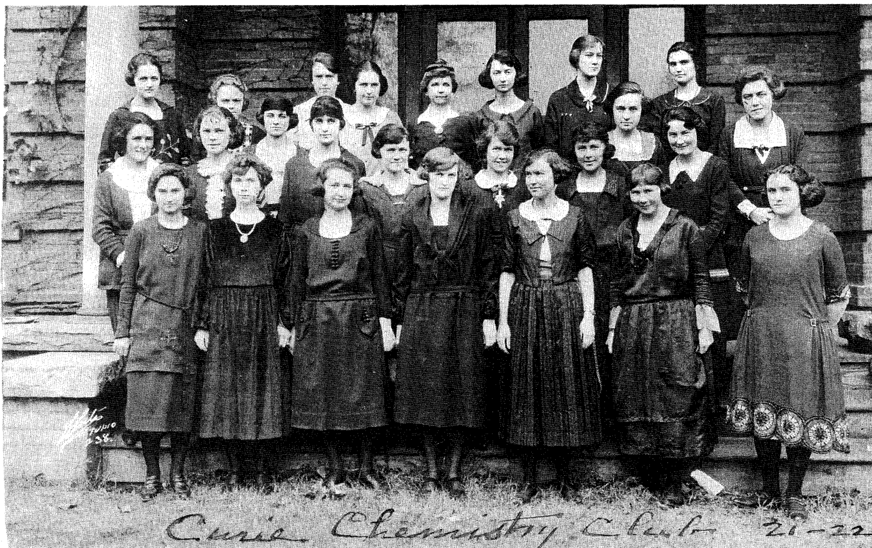
1921-22 members of the Curie Chemistry Club at Meredith. The club was the predecessor of the Barber Science Club, organized in 1929.