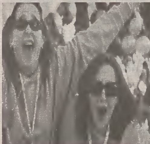
Cornhuskin' 2006

Thursday, being the day before Friday's Cornhuskin' competition, is a day devoted solely to class practices. Even though these practices are scheduled from 6 p.m. until 12 a.m. in the