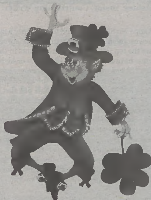
Leprechauns and shamrocks are common symbols of the holiday.

-St. Patrick's Day!! With: Zoogma & Special Guest Thursday, Mar 17 9:30p to Friday, Mar 18 12:00a at The Pour House Music Hall, Raleigh, NC