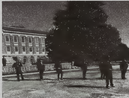
Enloe High School U.S. Army JROTC Drill/Exhibition Team performs in front of Johnson Hall.