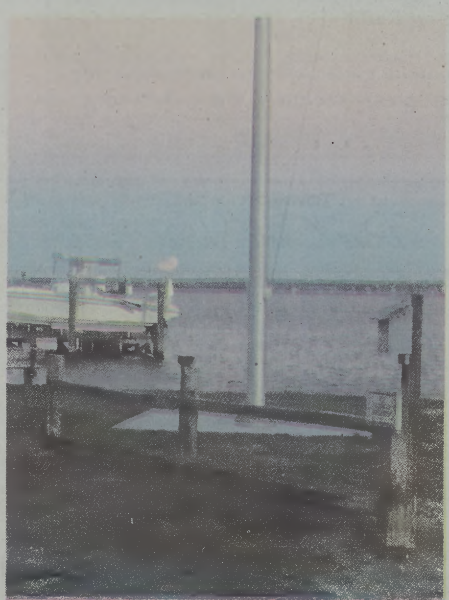
Total lunar eclipse in progress . McNeili Park provided the perfect spot for Susan King to catch this shot of the lunar eclipse around 6:30 a.m. on January 31.