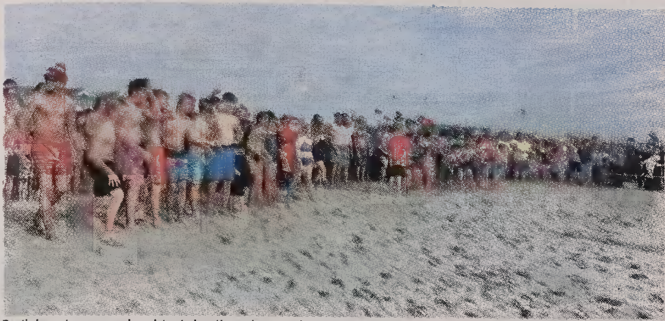
Participants are poised to take the plunge, happy that the day's weather was fair and unseasonably warm.