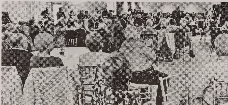
Over 200 people came to The Country Club of the Crystal Coast to hear the plans for renovations that will take place over the next few months.

On January 18, The Country Club of the Crystal Coast conducted its annual meeting. This year, the format of the meeting was much different than previous years in that this year's meeting marked a major change for the club. The purpose was to kick off and celebrate our new business model. As you may recall, we have been working through golf course damage associated with last winter's weather, followed by significant damage caused by Hurricane Florence. The financial situation that these two events caused resulted in the purchase of the assets by PKS CC, LLC, and the hiring of Carolinas Golf Group to operate the club.