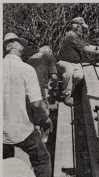
Volunteers came out in numbers to help rebuild the sittum at Ocean Park. Thanks to all who were willing to lend a hand.