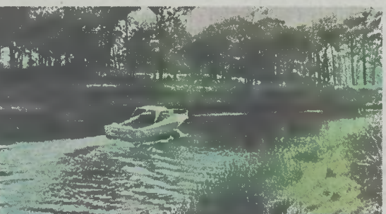
Pine Knoll Shores Waterway in an early advertising booklet