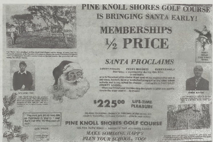
The Pine Knoll Shores Golf and Country Club opened with 9 holes in 1970.