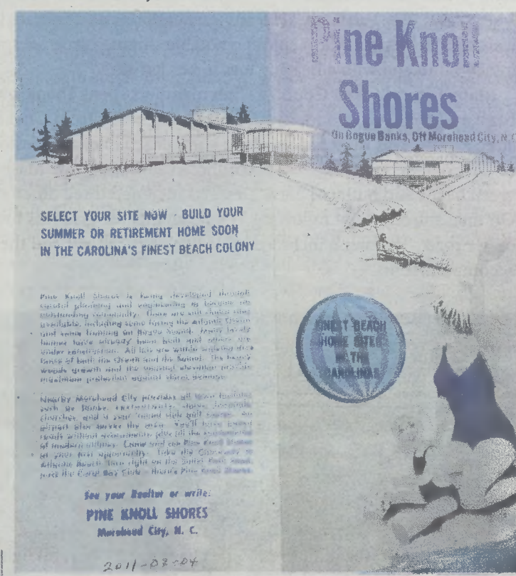
Advertising brochure from 1957