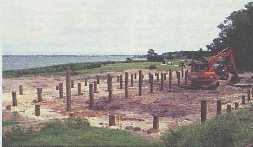
Finally underway! Targeted for completion in 2007, construction of the new clubhouse of the Country Club of the Crystal Coast has begun.

The first problem occurred after the Memorial Day weekend when Waste