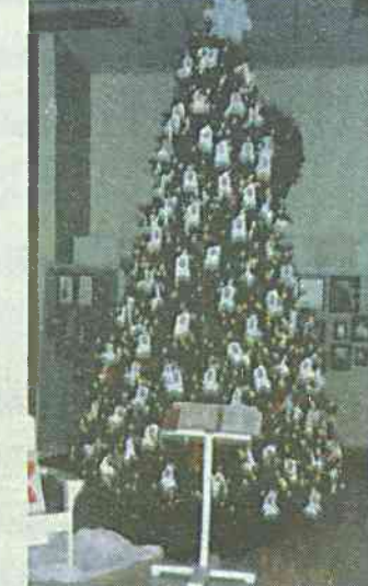
'tis almost the season

Now in its third decade, the festival is a week-long series of events that play out against the backdrop of a hall full of seven and nine foot trees, one more beautifully decorated than the other. Last year some 70 trees graced the hall and organizers are