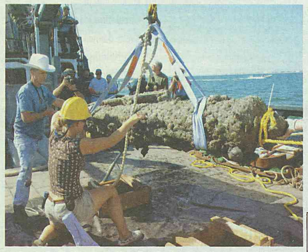
It's Heave Ho Me Hearties as Cape Fear Community College students help hoist a 2,500 pound cannon from the presumed wreck of Blackbeard's flagship, the Queen Anne's Revenge. Story on page 4