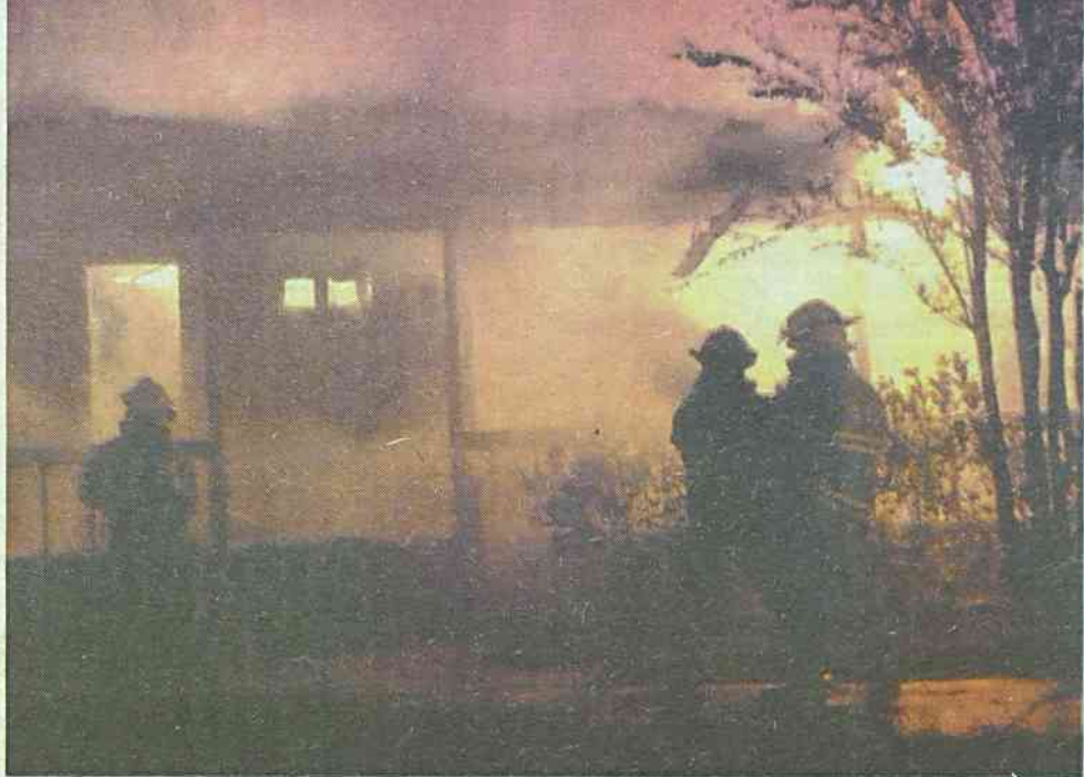
Firefighters are silhouetted against the flames as they battle the early morning blaze Oct. 16 at the Robuck home on west Oakleaf Drive. Story on page 4