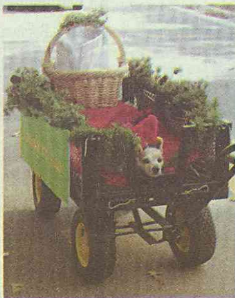
Rodney the pooch had a float all to himself in the PKS Christmas parade. Story on page 3.

But Pine Knoll Shores residents were not about to let the unseasonable weather deter them from getting into the holiday spirit. They kicked the season into high gear on the very first day of the month with the town's annual Christmas parade