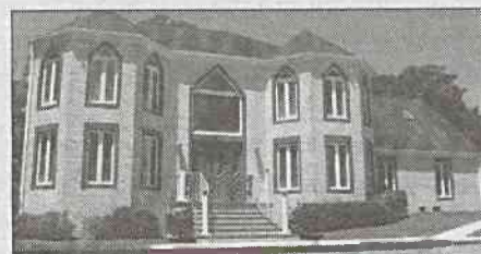
101 Cypress Drive $795,000