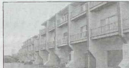
17 Coral Shores $537,000