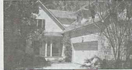
126 White Ash Court $697,000