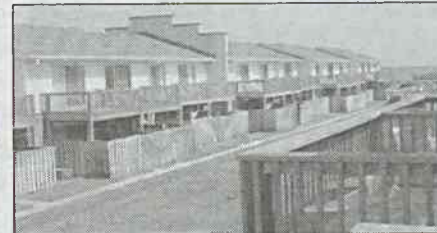
72 Pine Knoll Townes $330,000