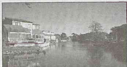
B-10 Reefstone $259,000