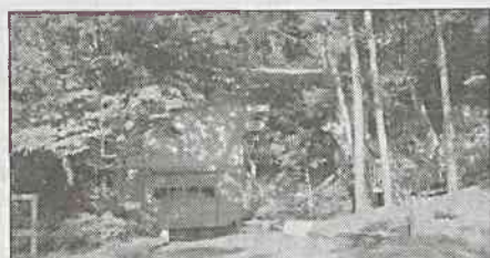
123 Mimosa Blvd. $329,000