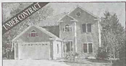
146 Arborvitae Dr. $945,000

We Can Show & Sell You All Properties Listed In Our MLS System. Call Us.