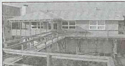
121 Knollwood Dr. $1,470,000