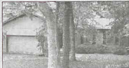
106 Hawthorne Drive $298,000