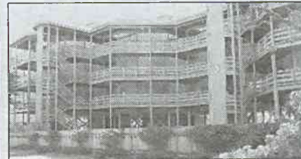
B-24 Breakers $485,000