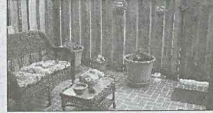
76 Pine Knoll Townes $327,000