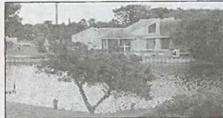
#5 Bermuda Greens $300,000