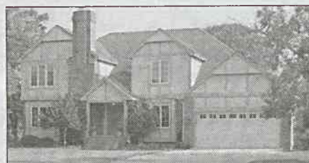
105 Laurel Ct. $450,000