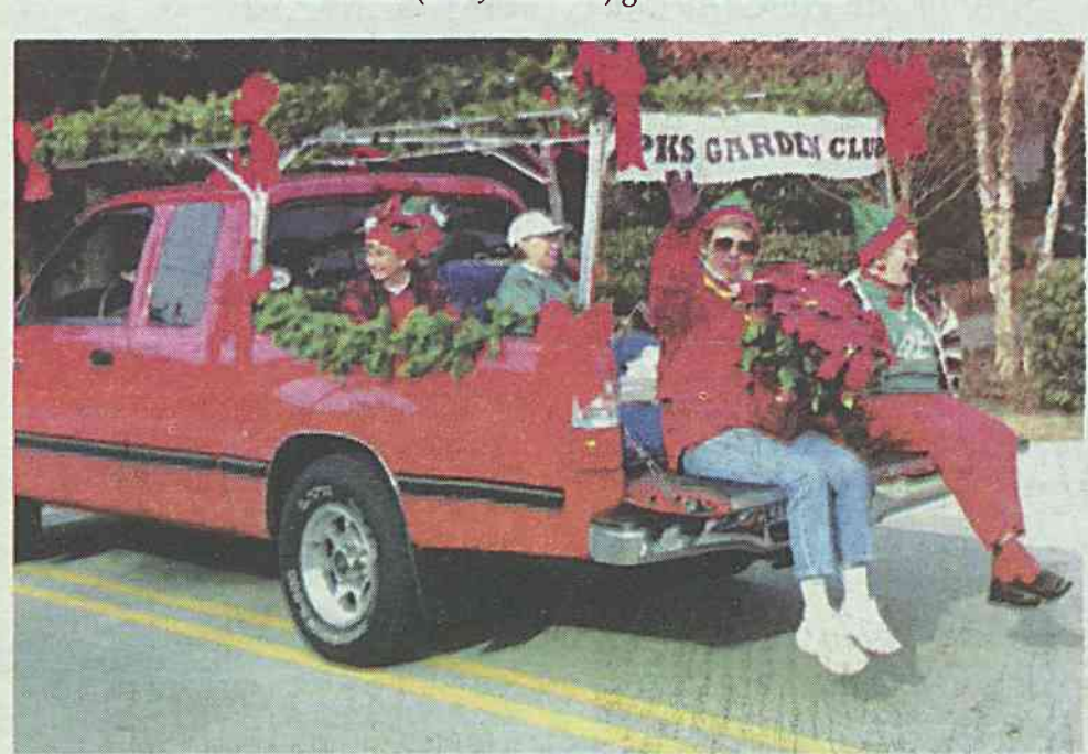
Garden Club members truck on down.