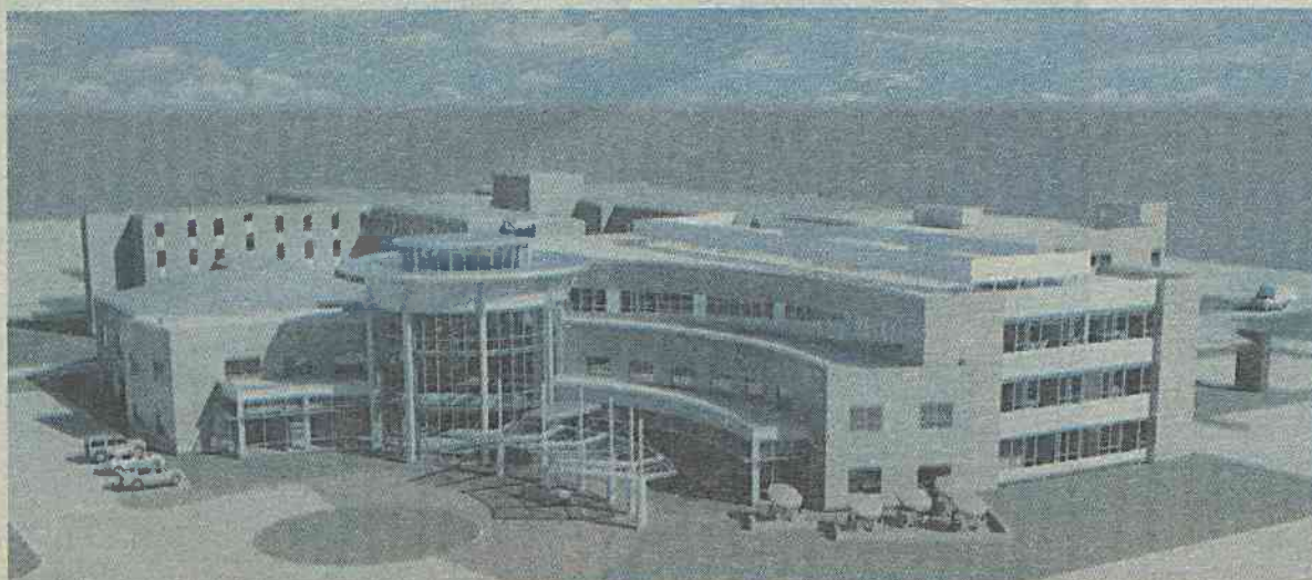
Computer-generated rendition of proposed hospital exterior