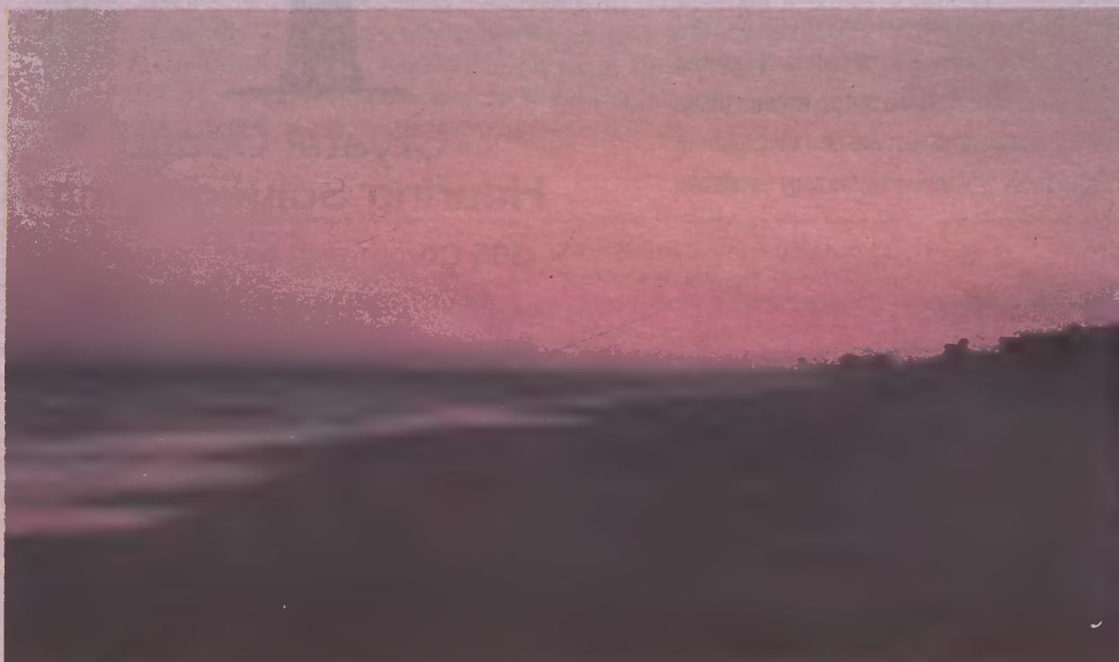
Fire in the sky. This shot was taken recently on the beach in Pine Knoll Shores just after sunset.