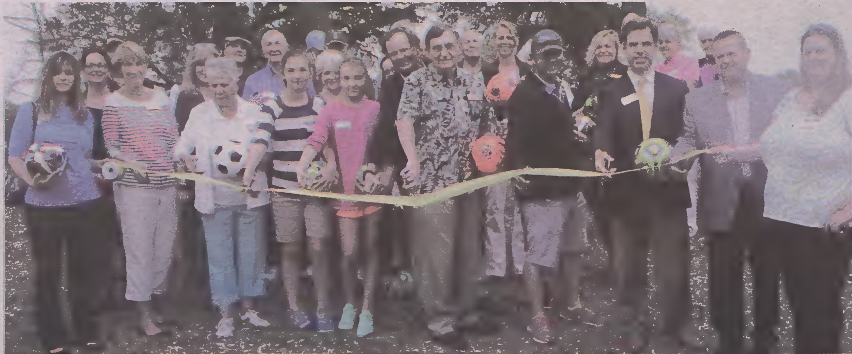
Ribbon-cutting for the new soccer golf course at the Country Club of the Crystal Coast.

League handicaps will be established after three weeks of play. The league is open to the public, and the cost is $320 per person, which includes a cart, weekly event holes and a banquet with prizes at the end of the 12 weeks. League members can also schedule a tee time and come early on league play days and play an additional 9 holes for $9 per person. The deadline to sign up for league play is 5 p.m. on Friday, May 27. A $200 deposit is due at the time of registration and the balance of $120 is due on or before July 6.