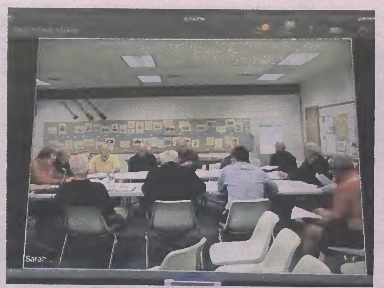
Webinar image as it appeared on an iPad screen during a recent town committee meeting.

Next dinner with the mayor for out-of-town homeowners. In February we will host our third annual dinner with the mayor in the greater Raleigh area. We started these a few years ago as an outreach tool to our second-home owners. We time this so that it takes place immediately following our