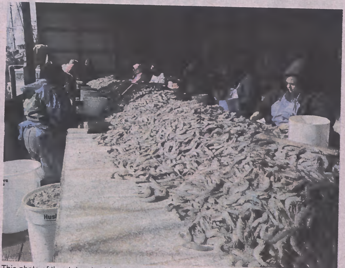
This photo of the shrimp haul from the Capt. Nathan in Swan Quarter was taken on December 5. Workers here had been heading shrimp for about four hours at the time of the photo, with an estimate that each of the 14 workers onsite had headed over 100 pounds of shrimp each (1,400 pounds total). At least 280 baskets of shrimp had been unloaded, with still more coming out of the hold. To put this into perspective—if the total haul turned out to be 300 baskets at 50 pounds each, that would be 15,000 pounds of shrimp. With the 21-25 count shrimp available for just $6 per pound, it's safe to call this a good year to stock the freezer.