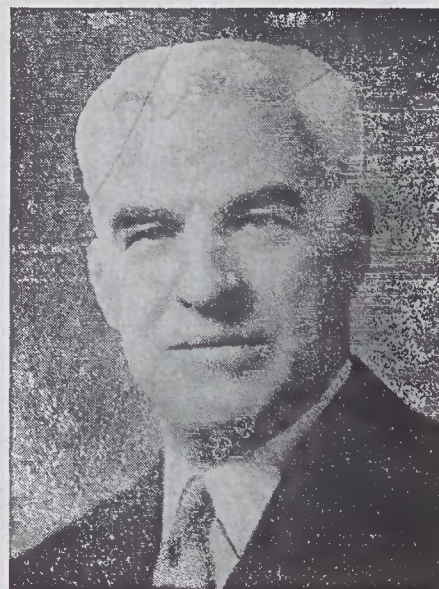
EDWARD R. STETTINIUS, JR.